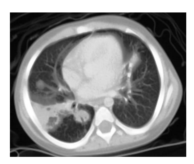
Figure 1. Bilateral noduler consolidation and cavitation in the lung

Tissue sampling was recommended. A biopsy specimen from the skin nodule showed a highly atypical lymphoid infiltrates that displayed a prominent angiocentric and angiodestructive pattern of growth. Histopathologic examination showed extensive destruction and large necrosis area of nodule diffusely by a malignant lymphocytic infiltration that was CD20, CD3, CD3 epsilon positive but ALK, EMA, CD30, CD5, CD56 negative, larger than normal lymphocyte, atypical, a marked nucleolus, and concentrating around the blood vessels (Figure 2a, b, c). EBV LMP-1 immunostainning was strongly positive (Figure 2d). The histopathologic findings in most areas were consistent with grade III lesions were described a monomorphic infiltrate and marked cytological atypia in both small and large lymphoid cells.1-4 No yeast, fungi or acidfast bacilli were detected. Pathologic diagnosis was CD20 positive B-cell lymphoma with reactive Tcells.