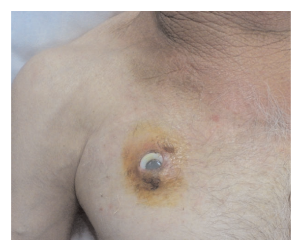
Figure 4. Subject who had skin necrosis, port catheter is clearly seen through necrotic area.

enduration, no problem was faced during the further sessions of this subject. There was no case facing with a problem in short term (first 30 days) except this subject.