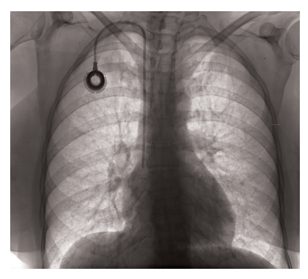
Figure 2. Digital radiography of the subject who underwent placement of port catheter through right internal jugular vein.