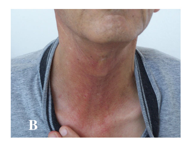
Figure 1. (A) Skin metastasis region with induration and erythema in the neck, before chemotherapy. (B) Three months after chemotherapy, induration and erythema resolved and hyperpigmentation was evident on the skin.