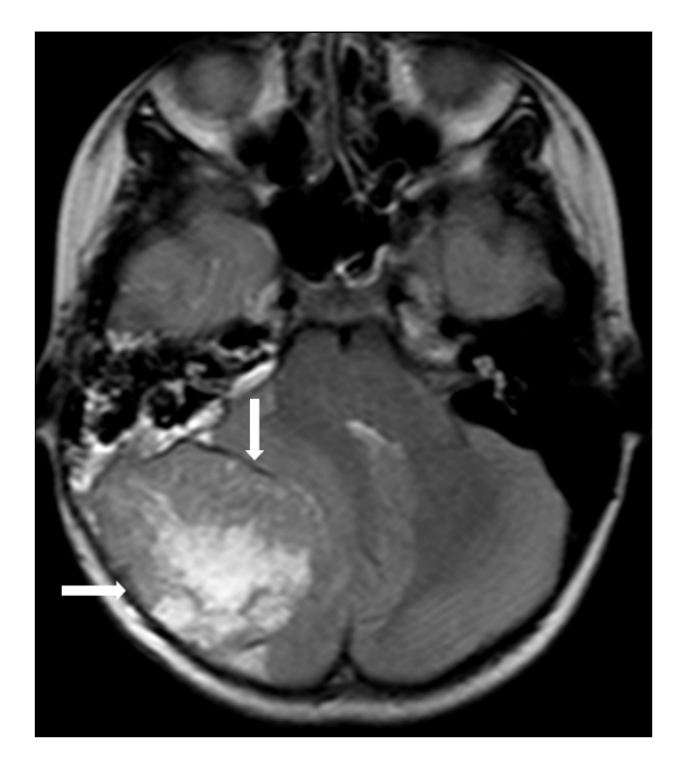
Figure 1. A T2 weighted axial MR image through the posterior fossa shows a dural-based right posterior fossa mass with heterogeneous signal intensity. The lesion also has cystic/necrotic areas. Displacement of right cerebellar hemisphere and brain stem with fourth ventricle compression were also present.

diagnosis of the original tumor was 12.3±8.4 years and the median time from the initial diagnosis to the finding of CNS involvement was 3 years.¹ Our patient relapsed to cerebellum 39 months later from the primary tumor treatment.