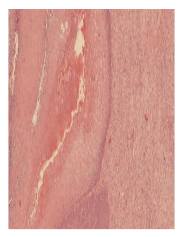
Figure 1. Micrograph showing the tumor composed of malignant spindle cells underlying the normal tongue mucosa (H&E x40).

her clinicopathologic features of these cases are summarized in Table 1.